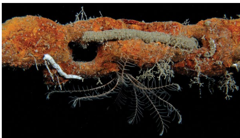
Marine organisms populating the Annapolis.

In 2015, the Annapolis, a decommissioned naval ship, was sunk in Ch'á7clsm/ Halkett Bay, on the south-east of Chá7elkwnech/Gambier Island to create an artificial reef. Due to historical log boom storage in this area, habitat potential was reduced compared to other nearby sites. The sinking of the Annapolis was thus designed to provide usable habitat to increase species abundance and diversity in the area, and is monitored by the Artificial Reef Society of BC (ARSBC) through their citizen science program, the Annapolis Biodiversity Index Study (ABIS) (see Resources). By early 2016, nearly 50 different marine species had made the Annapolis home (see Annapolis , Ocean Watch Howe Sound Edition [OWHS] 2017).