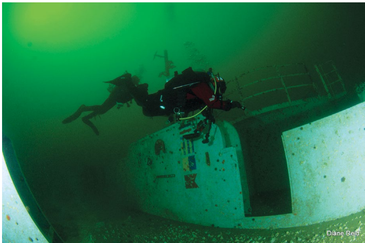
Divers on the Annapolis.

tat. Further details about climate change impacts on particular species can be found in the relevant articles (e.g., Critical Fish Stocks , OWHS 2020).