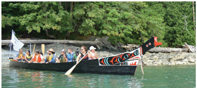
Squamish Nation canoe at Camp Suzuki.

Each year, over 22,000 students experience environmental education with Howe Sound as the classroom. The Howe Sound area hosts the largest regional cluster of summer camps, outdoor schools, and environmental programs in British Columbia. 1 Many more, young and old, meet and learn about nature through schools and universities, local community groups, and commercial ecotourism in Howe Sound. This outdoor learning relies on proximity to Vancouver and the diverse geography and ecology that Howe Sound offers.