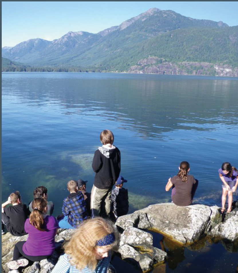
Sea to Sky Outdoor School students studying marine ecology on Gambier Island.