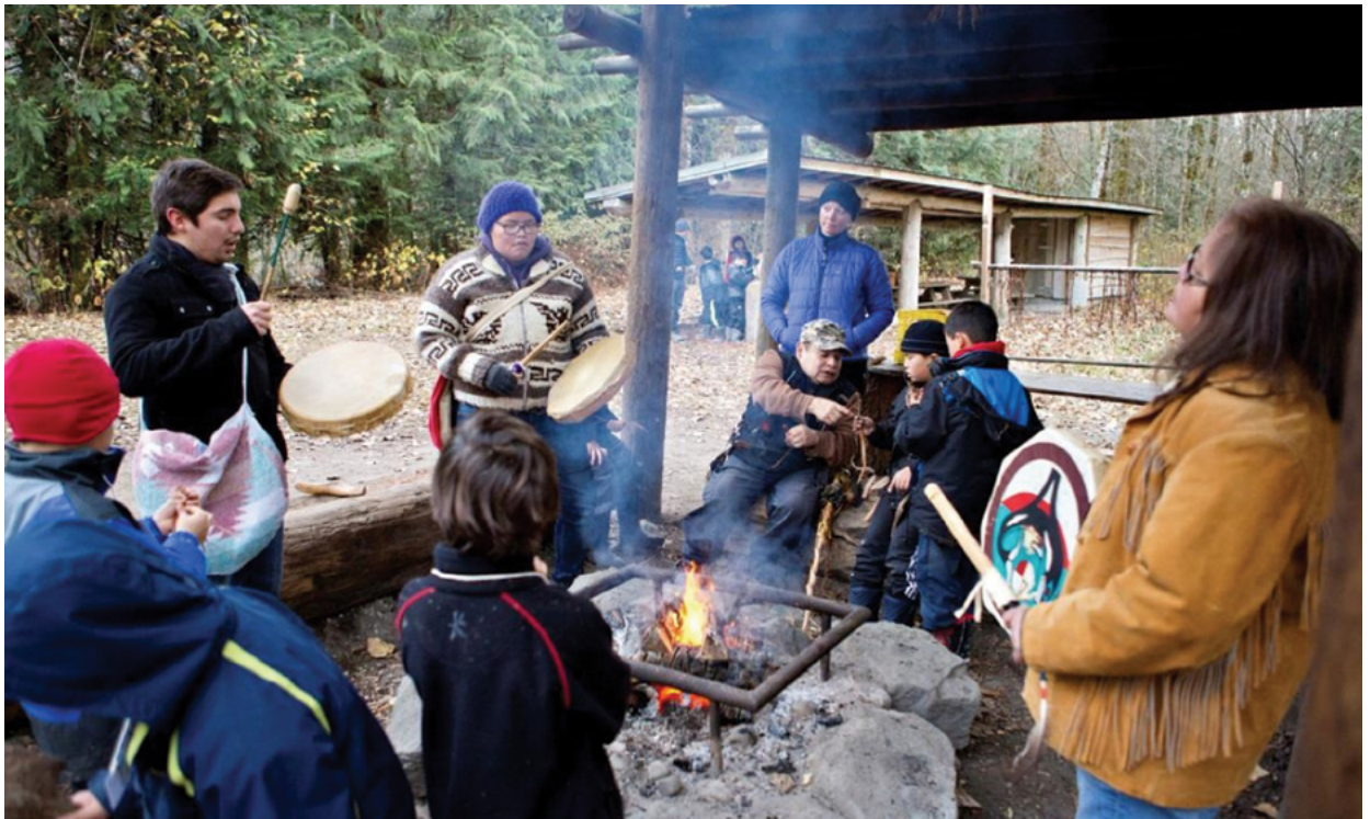
Skw'une-was ceremony.

The Skw'une-was program at Cheakamus Centre has shared traditional practices of First Nations people since 1986 through its overnight programs at its Coast Salish Big House. Students engage in traditional long house life, eating traditional foods over open fires, hearing local legends and traditional songs; and learning about ceremonies, medicinal plants, basket-weaving and carving.