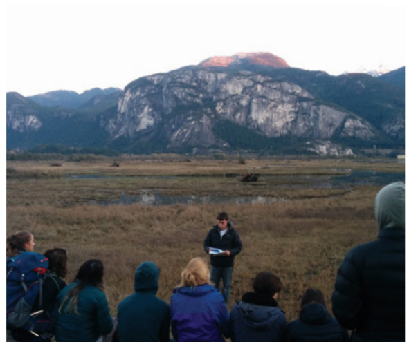
Capilano University students discuss the natural history of the Squamish Estuary.

According to the United States Environmental Protection Agency (EPA), environmental education is a process that allows individuals to explore environmental issues, engage in problem solving, and take action to improve the environment. As a result, individuals develop a deeper understanding of environmental issues and have the skills to make informed and responsible decisions. 3 Between 2001 and 2004 the American Camp Association conducted research with over 5,000 families from 80 camps to determine the outcomes of the camp experience as expressed by parents and children. Parents, camp staff, and children reported significant growth in self-esteem, peer relationships, independence, adventure and exploration, leadership, environmental awareness, friendship skills, values and decisions, social comfort, spirituality. 4 It's not peer-reviewed research but check it out!