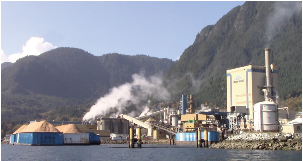
Howe Sound Pulp and Paper mill at Port Mellon.

Contamination in fish and shellfish has generally declined near HSPP to levels below the Health Canada consumption criteria, 2,3 but advisories to limit consumption of crab (i.e., specifically the hepatopancreas where dioxins are concentrated) are posted and remain in effect in Howe Sound. 4 Environment Canada oversees an Environmental Effects Monitoring (EEM) program that continues today at the HSPP mill.