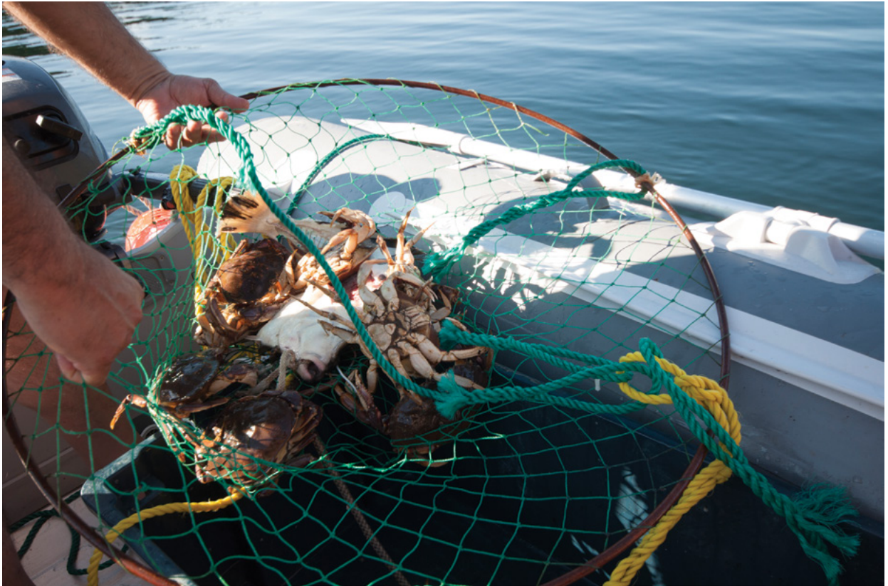
Crab is a popular food item for fishers in Howe Sound but some areas remain closed to crab fishing due to contamination.